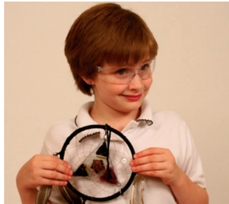
Child Size Safety Goggles, Item No. 40074T

All AMACO® lesson plans state that adults and teachers supply adequate supervision for children and students, as many art curriculums are expanding to include glass. Always use safety goggles. Safe firing instructions can be found at amaco.com or by calling AMACO® Customer Service Monday through Friday, from 8 to 5 EST.