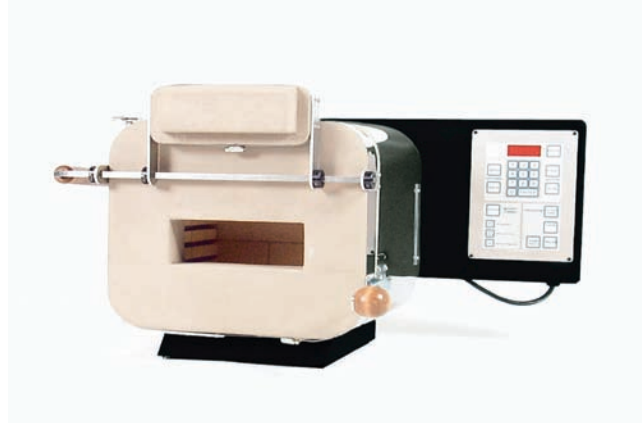
Shown with bead door open, main door closed.

Although not optimal, a ceramic kiln will fire glass adequately for most school projects. Glass requires a more precise firing process than ceramics; AMACO® recommends that only Select Fire™ or computerized kilns be used to fire glass. For easy to follow step-by-step computer programming, visit www.amaco.com and download the Glass Kiln Manual.