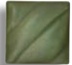
LM-46 (1) (TL) Dark Green