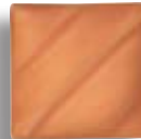
LM-65 (1) (TL) Butterscotch