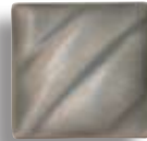
LM-15 (1) (TL) Dove Gray