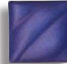
LM-20 (1) (TL) Blue Iris