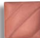
LM-53 (1) (TL) Orchid