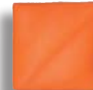
LM-66 (1) (TL) Orange