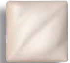
LM-11 (1) (TL) Opaque White