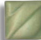
LM-42 (1) (TL) Parakeet Green