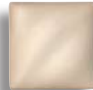
LM-10 (1) (TL) Transparent Matt