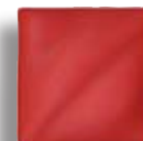
LM-56 (1) (TL) Red