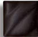
LM-1 (1) (TL) Satin Black