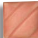
LM-52 (1) (TL) Pink