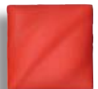
LM-54 (1) (TL) Coral