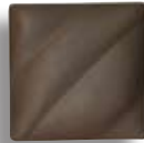
LM-16 (1) (TL) Elephant Hide