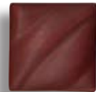
LM-30 (1) (TL) Cocoa Brown