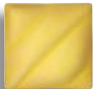
LM-60 (1) (TL) Daffodil Yellow