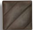
LM-202 (1) (TL) Dark Gray