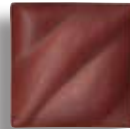
LM-32 (1) (TL) Red Brown