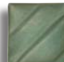
LM-244 (1) (TL) Blue Green

LM Series glazes fired on 25M White Clay bisque buttons.