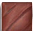
LM-230 (1) (TL) Brown