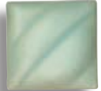
LM-25 (1) (TL) Robin Egg Blue