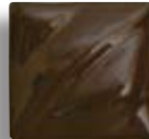
SE-731 (1) Natural Brown