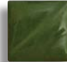
SE-740 (1) Dark Green