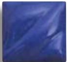
SE-720 (1) Dark Blue