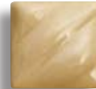
SE-732 (1) Dark Buff