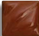
SE-730 (1) Red Brown