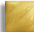
SE-760 (1) Yellow