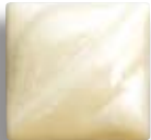
SE-710 (1) White