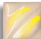
V-1-S-1308 (1) (1) Yellow