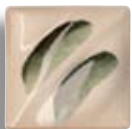
V-1-S-1370 (1) (1) Black