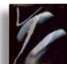
V-1-S-1360 (1) (1) White