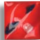
CTL-50 (1) (P) Holiday