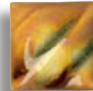
CTL-31 (1) (P) Brown Earth