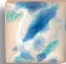
CTL-12 (1) (P) Mardi Gras