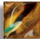
CTL-35 (1) (P) Nutmeg