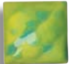
CTL-41 (1) (P) Melon