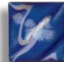
CTL-22 (1) (P) Milky Way