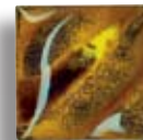
CTL-36 (1) (P) Ginger Bread