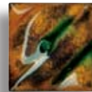
CTL-65 (1) (P) Oasis

All AMACO® glazes that carry the AP Non-Toxic seal in liquid form also carry the seal in dry form, but mixing instructions on the label should be followed to prevent dust to ensure safe use.