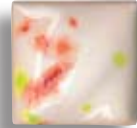
CTL-9 (1) (P) Snap Dragon