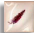
CTL-11 (1) (P) Snow Fire