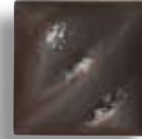
CTL-3 (1) (P) Lava