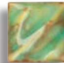
CTL-43 (4) Aurora