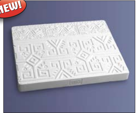
32228C MCTM-1 Pre-Columbian Multicultural 8½" x 11" x 1" SSU=1, Shipping Weight 5 lbs.