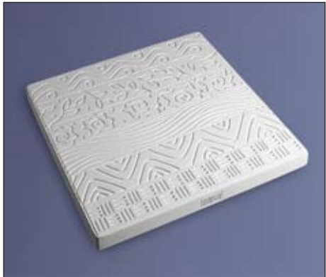
32220W TM-3 Geo/Floral 6-Pattern Design 12" x 12" x 1" SSU=1, Shipping Weight 8 lbs.