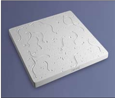
32218R TM-1 Confetti 12" x 12" x 1" SSU=1, Shipping Weight 8 lbs.

B R U S H E S T O O L S & S U P P L I E S