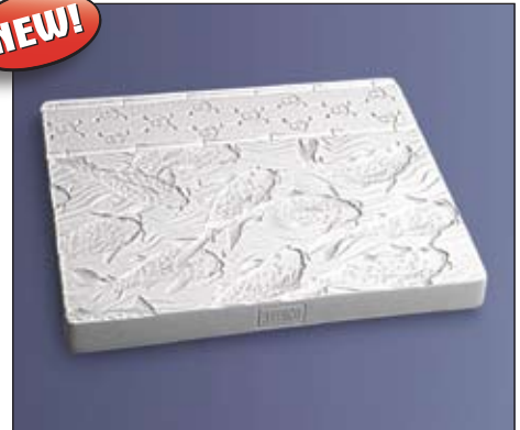
32229D MCTM-2 East Asian Multicultural 8½" x 11" x 1" SSU=1, Shipping Weight 5 lbs.