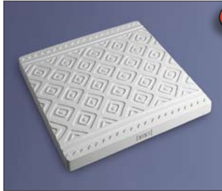
32219V TM-2 Tribal Diamond 12" x 12" x 1" SSU=1, Shipping Weight 8 lbs.