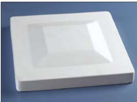
10" Square Hump Mold

32214L HDM-18: 8 1/2 " x 12 1/2 " x 1", Letters 1" W x 1 1/2 " H x 1/8" D, 4 lbs.