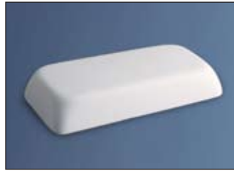
32263L DM-2: 9 3 / 8 " x 4 1 / 2 " x 1 1 / 2 ", 2 lbs.