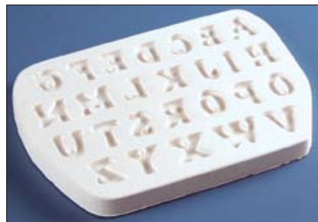
Alphabet Drape Mold

32214L HDM-18: 8 1/2 " x 12 1/2 " x 1", Letters 1" W x 1 1/2 " H x 1/8" D, 4 lbs.