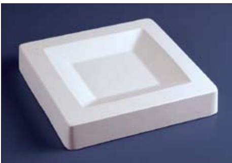
8" Square Slump Mold