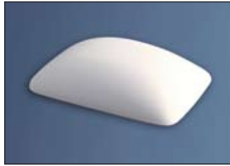
32262K DM-1: 7 1 / 4 " x 5 5 / 16 " x 1 5 / 8 ", 2 lbs.

This fine set of drape molds is widely used in schools, institutions, the military and they are particularly useful in the occupational therapy departments of hospitals. Available in seven shapes and sizes, these molds can be used to make an unlimited number of forms including bowls, platters, planters, vases, masks, dishes, etc. Just drape a slab of clay over the top of the mold and let your imagination do the rest. SSU=1.