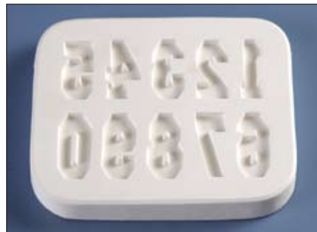
Numbers Drape Mold

32215M HDM-19: 7" x 5 1/4 " x 1", Numbers 1" W x 2" H x 1/8" D, 2 lbs.