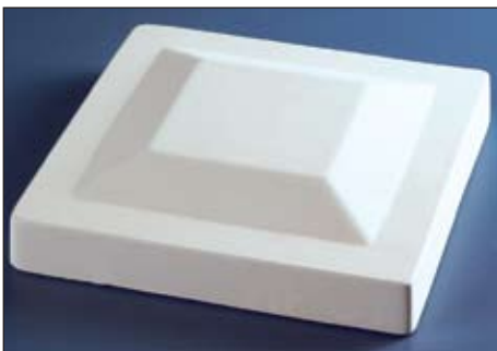
8" Square Hump Mold