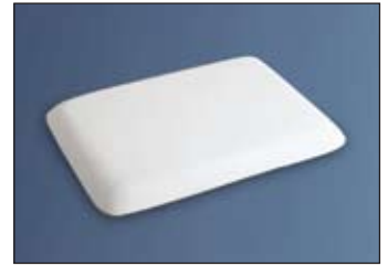
32264M DM-3: 10 3 / 4 " x 7 1 / 2 " x 7 7 / 8 ", 3 lbs.