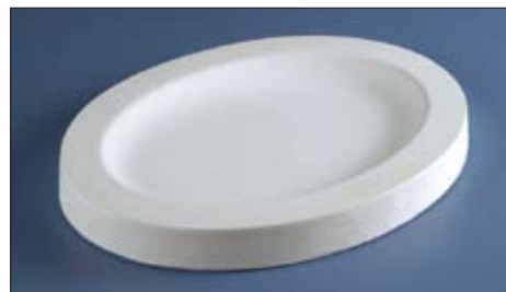
Oval Platter Slump Mold