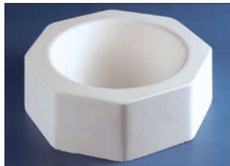
9" Round Slump Mold

32209J HDM-12: 9" diameter, 3 3/4 " H, 7 lbs.