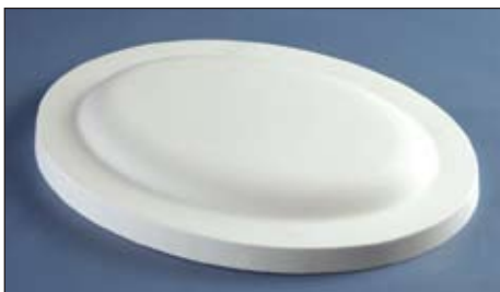
Oval Platter Hump Mold

32203C HDM-16: 9" diameter, 5" H, 16 lbs.