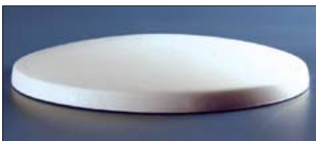
13" Dinner Plate

32210N DM-8: 10 3/4 " Salad Plate, 5 lbs.