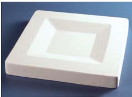
10" Square Slump Mold